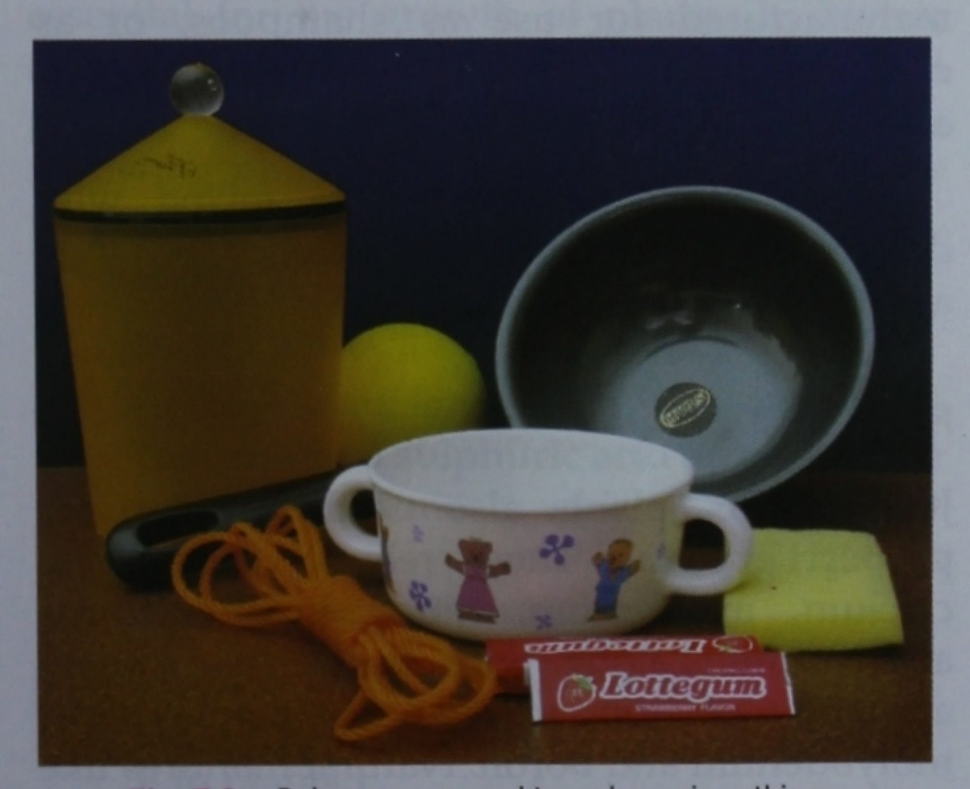
Fig. 7.2 Polymers are used to make various things.

A single unit, called a monomer, is repeated many times over to form what is known as a polymer.