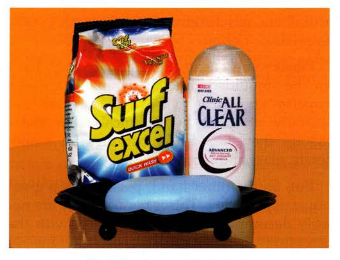
Fig. 7.3 A soap and detergents

The process is called saponification. At this stage, common salt is sprinkled over the liquid to help the soap separate out. The soap is filtered, washed, mixed with dyes and perfumes, dried and cut into cakes.