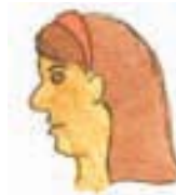
A Pug Nose