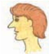
A Roman Nose